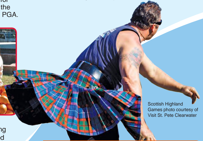
Scottish Highland Games

Downtown Dunedin hosts more than 50 events each year. Hundreds more events take place throughout the community. There are multiple arts and crafts shows, a traditional Mardi Gras celebration, Wines the Blues, the Scottish Highland Games and a Celtic Festival, as well as other special events with something for everyone.