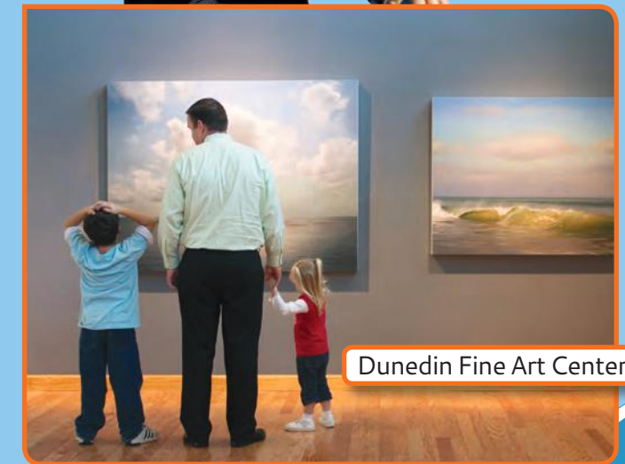
Dunedin Fine Art Center